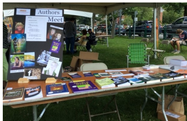
The LVW table at this summer’s Bookstock Festival!

INTERESTED IN HELPING TO MAKE BOOKSTOCK AN ANNUAL EVENT THAT LVW ATTENDS? PLEASE EMAIL LVW@LEAGUEOFVERMONTWRITERS.ORG WITH INTEREST IN SERVING AS AN ORGANIZER.